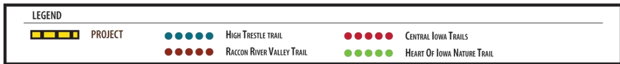
Project Location Map Raccoon River Valley Trail to High Trestle Trail “Connector” project